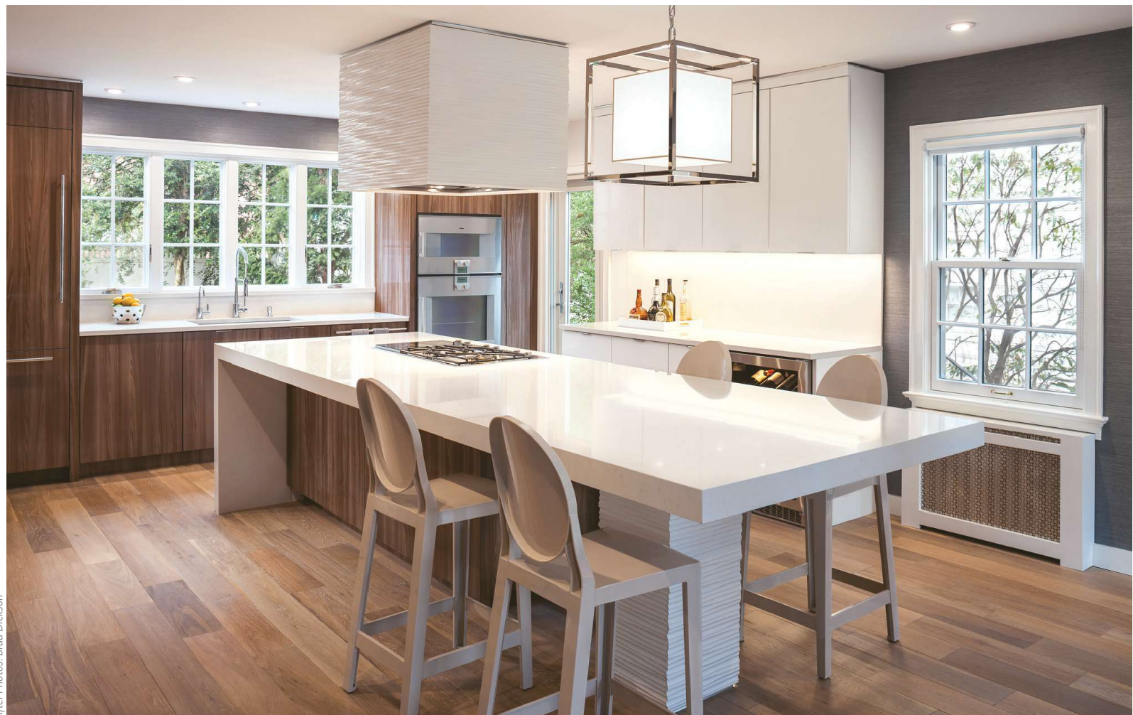
After Photos: Brad Dickson

View more after photos at KitchenBathDesign.com